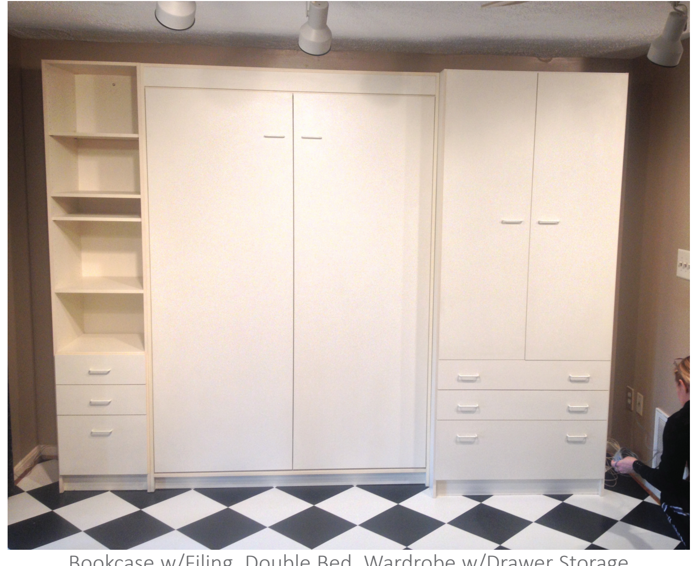
Bookcase w/Filing, Double Bed, Wardrobe w/Drawer Storage