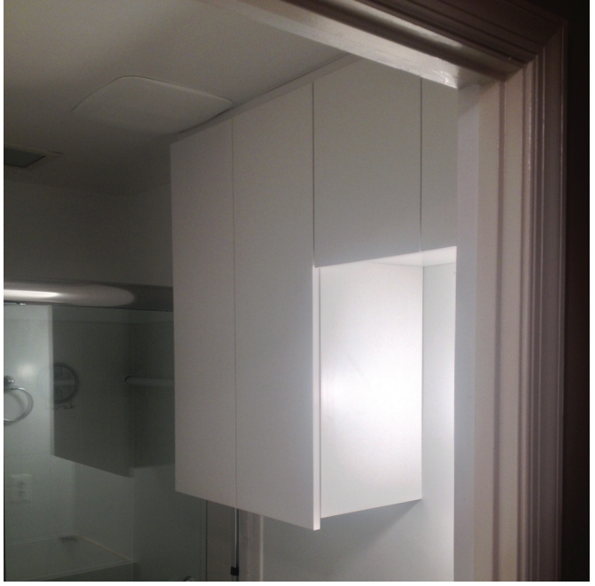
SMITH RESIDENCE (DM) 2013

FINISH: (CW) CHALK WHITE PULLS: (N) CURVED STRAP